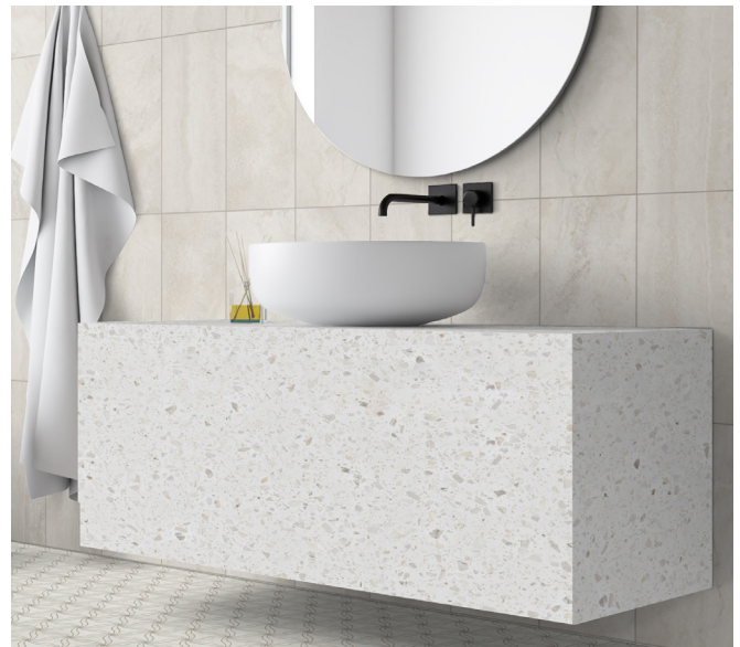
Iceberg Agglomerate Marble Slab

To appreciate the beauty of agglomerate marble, knowing how it is made enhances its appeal. A natural stone formed within the earth, marble is a metamorphic rock, meaning it changes form. Think caterpillar to butterfly. When limestone, a sedimentary rock, is subjected to extreme heat and pressure over millions of years, it goes through a process of recrystallization which causes calcite crystals within the limestone to grow and fuse together. When this occurs, marble has been created.