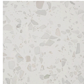
Iceberg Agglomerate Marble