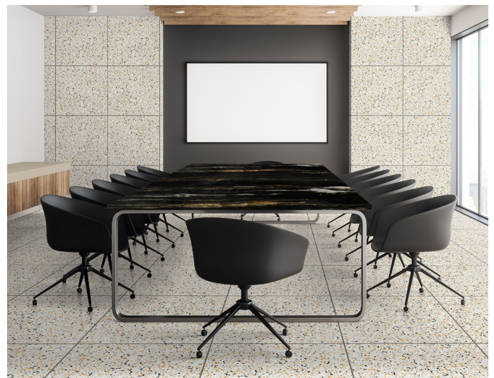
Vector Agglomerate Marble Tile

Vector is a polished agglomerate marble comprised of an off-white background, but where it really differs is in the marble chips. Embedded in this resin are small black, gold, and grey marble chips. This is a timeless way to add some color and playful energy to kitchen and bathroom floors, walls, and more.