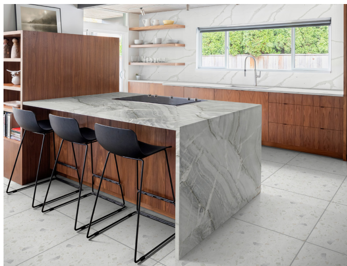
Iceberg Agglomerate Marble Tile

Similar to Classico and Iceberg, Vector and Regium offer many similarities but provide a more vibrant color palette.