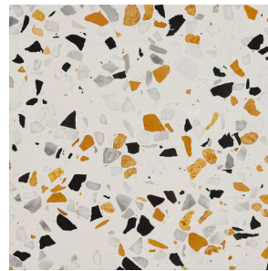
Regium Agglomerate Marble