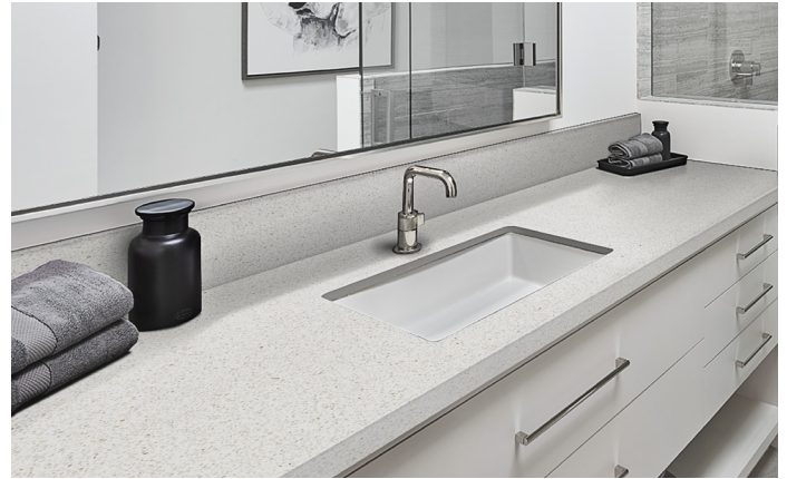
Classico Agglomerate Marble Tile

Classico is a polished agglomerate marble comprised of a white resin background that elegantly displays small, grey marble chips. Upon a closer look, there are some soft hints of beige that may appeal more to a warmer design, while still remaining neutral.