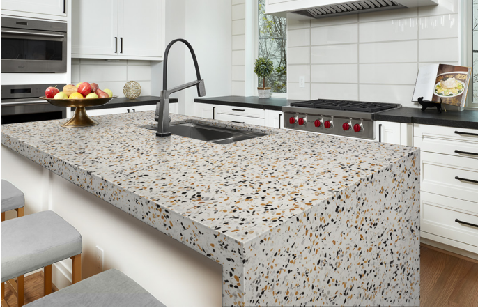
Regium Agglomerate Marble Slab